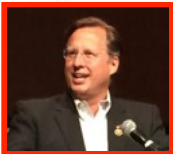
Congressman Brat is the Republican Nominee for the 7th district Congressional seat.

http://goochlandteaparty.org/sandy-rios/