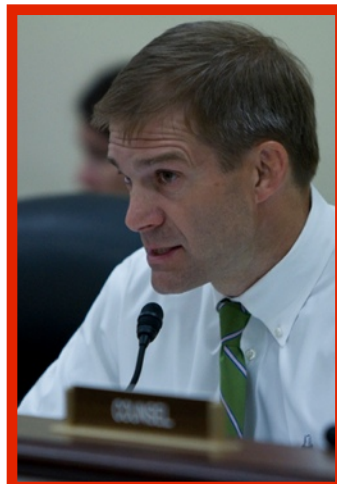
U.S. Congressman Jim Jordan of Ohio's 4th District

(Invitation and reply card also attached to the email that sent this newsletter to you.)