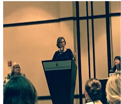
Carly Fiorina at VFRW

Our 7 th District was well represented at this year's conference!